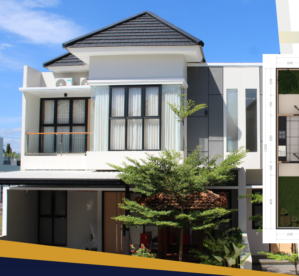
Denah Lantai 1