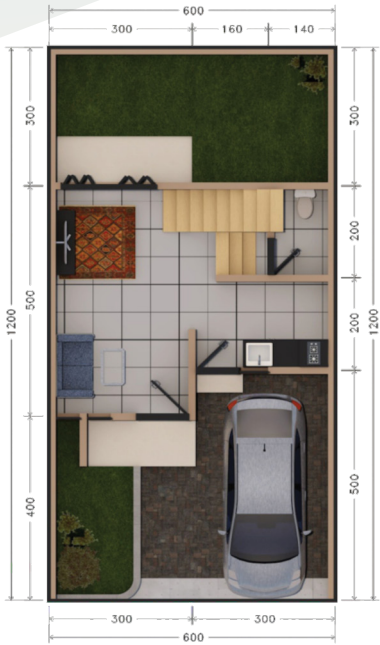
Denah Lantai 1